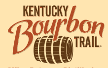
Miles Between Distilleries